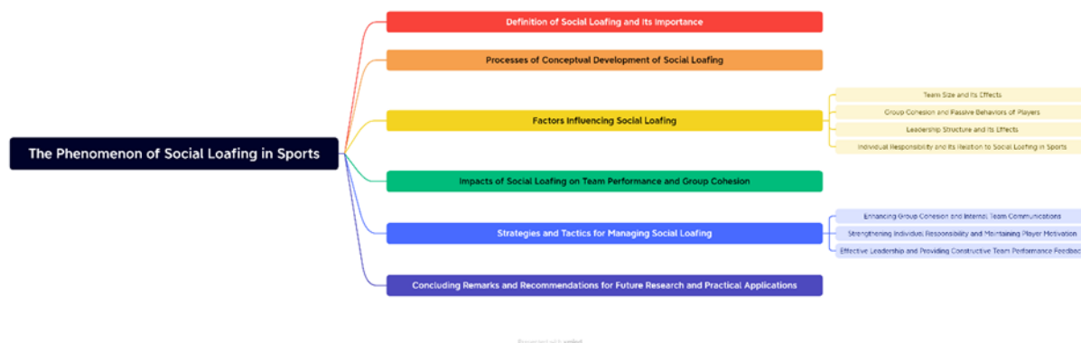
Figure 1. Conceptual Map of the Content Structure of Psychological Characteristics of the Phenomenon of Social Loafing in Sports

A collection of articles by Singh et al. explains the understanding of group behavior in volleyball from the perspective of social loafing. Garcia-Gonzalez et al. provide valuable insights into how team cohesion impacts social loafing in volleyball (Singh et al., 2018).