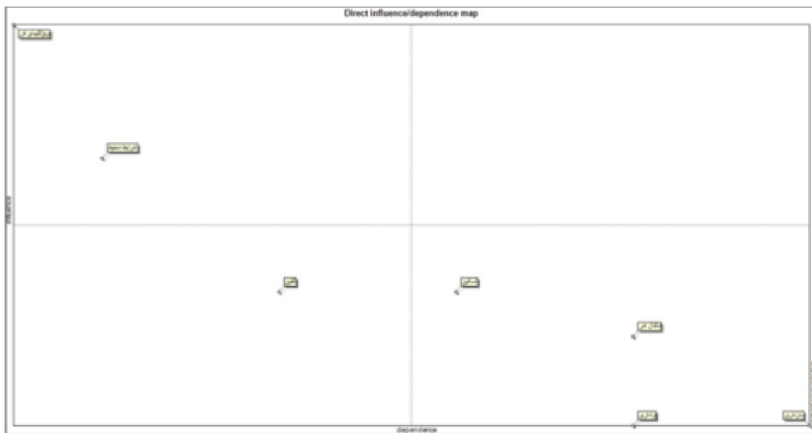
Figure 1. MicMac analysis result

factors with weak and moderate influence on power and dependence. Dependent factors have low influence power but relatively high dependence. These factors are usually targeted or result variables. Linking factors have high guiding power and dependence; influential factors have a high level of influence but low dependence (Malon, 2014).